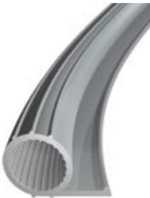
Silicone solid rubber, white