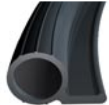
EPDM solid rubber black