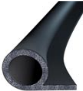
EPDM cellular rubber, black